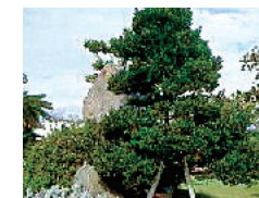
Ryukyu ebony (official tree)

“Netate” is the Japanese words that means “the root of things,” such as the root of a community or a festival. Ginowan City is often referred to as the root (“ne,” “nenoshima,” “netate”) of Ryukyu that had been vital in the island’s political, economic and cultural development. The city was an important centre of trade and information exchange with neighboring countries. Today, Ginowan continues to grow as a modern netate where people, goods and information flow in and out on an international level. “Netate no Machi Ginowan” is the watchword of the citizens of Ginowan that symbolizes the city’s endless potential.