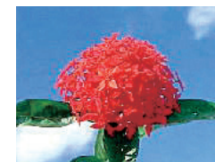
Sandanka (official flowering plant)

Traditionally used to make the sao (neck) of the sanshin (a traditional Okinawan three-stringed instrument). Adopted on January 11, 1996.