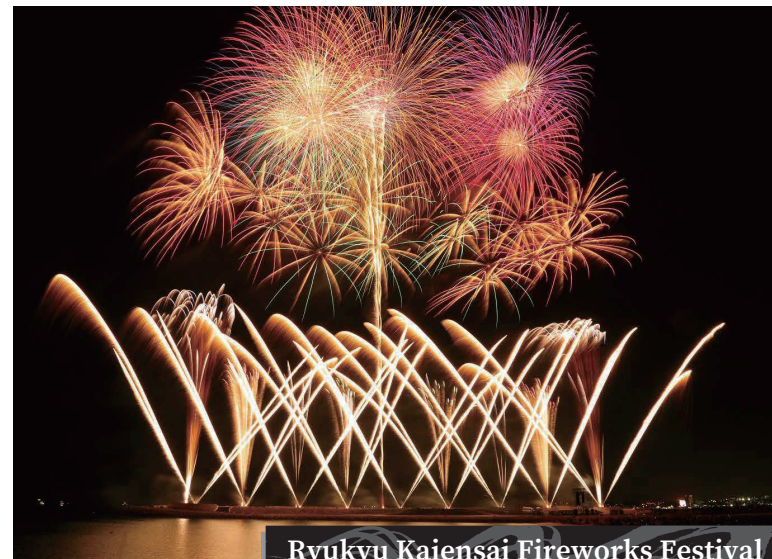
Ryukyu Kaiensai Fireworks Festival