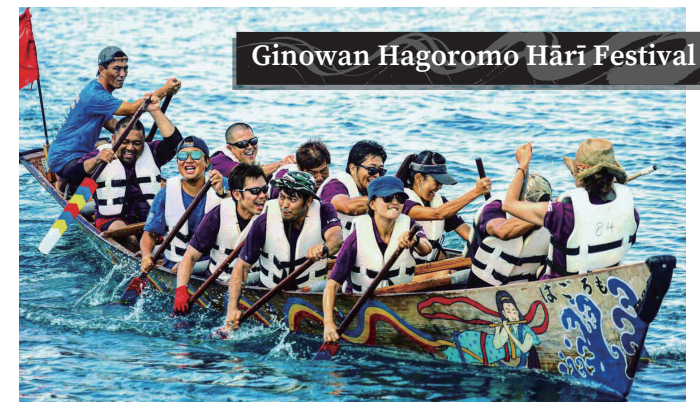
Ginowan Hagoromo Hārī Festival