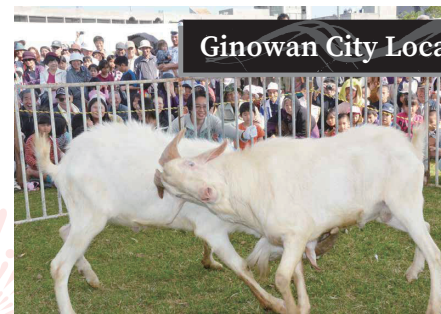
Ginowan City Local Industries Festival

To promote Ginowan's industries through the exhibition and sale of produce, seafood, livestock, and commercial and industrial products. Local Industries Festival Executive Committee ☎ 098-893-4411